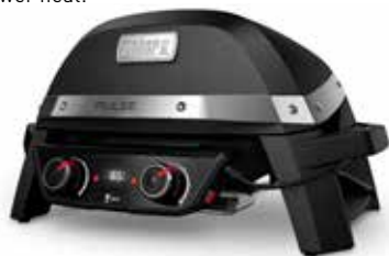
Weber Pulse 2000

The Pulse is available in two sizes – the compact Pulse 1000, and the larger Pulse 2000. With two heat zones and a grill space of 1911cm 2 on the Pulse 2000, you have the flexibility to split your cooking area; searing steak on high heat on one side, while on the other, your side dish cooks over a lower heat.